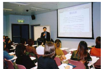
Relationship Enhancement Skills